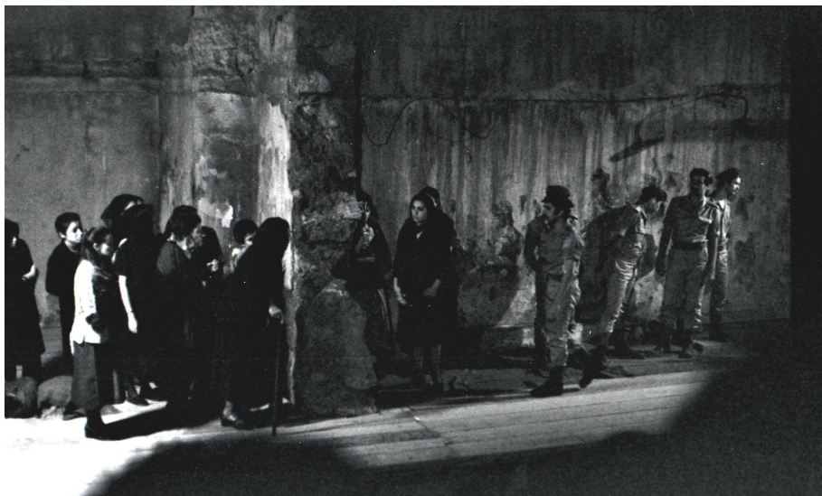
Scene from the production of Trojan Women at Kaplanon Street, Athens, September 1977. First use of contemporary costumes in ancient drama: the Chorus in dark clothes and the uniforms of Esatzides (Military Police) of Junta.

the dominant western trope of primitivism, archaism and pre-hellenic art references in the '70s. 61