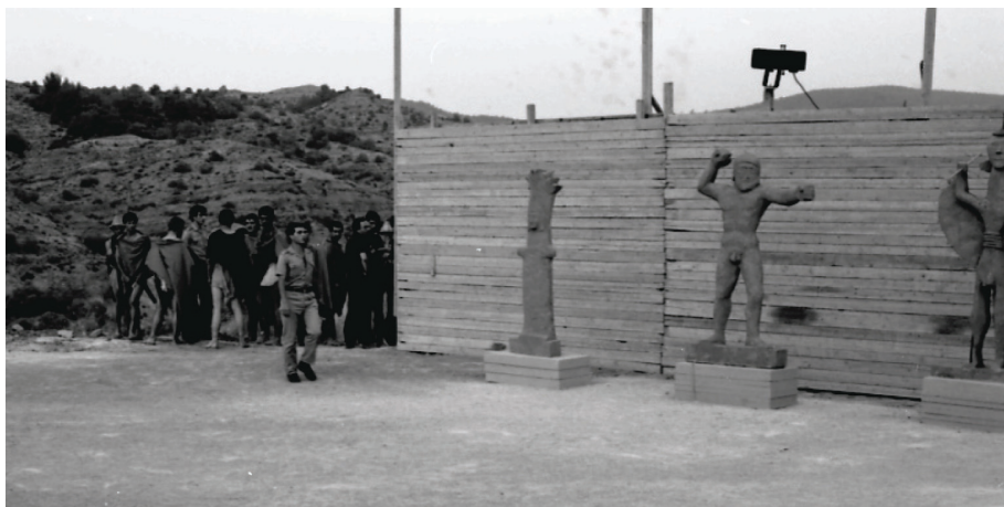
View of the scenic space in Tsarouchis' production of Seven against Thebes , Mosxopodio, Thebes, 1982. Temporary staging arrangement in the natural landscape.

We must take into consideration that for Greece — as with other countries with a rich archeological heritage —, spatial categorizations based on the material functions of the physical space such as historical locale and archeological site, are fundamental. These acquire an added socio-cultural significance, both on a symbolic and imaginary level, influencing all physical strata and realms of urban, rural and natural space; 32 this is especially the case for the outdoor amphitheatres of antiquity like Epidauros. From another viewpoint which elaborates on this discourse, the ancient theatre of Epidauros could be considered a kind of national heterotopia, where different versions of the nations' real and imaginary aspirations regarding its past, present and future get played out in the open. 33